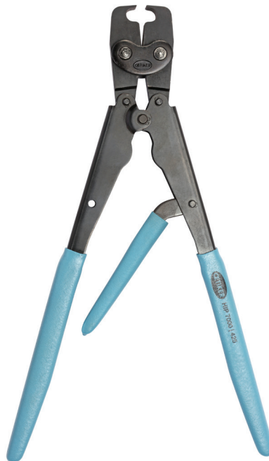
Hand Installation Pincer for Ear Clamps HIP 7000 | 425 Item No. 14100425

Increased handle length: Higher closing force