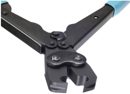
Hand Installation Pincer for Ear Clamps HIP 7000 | 425