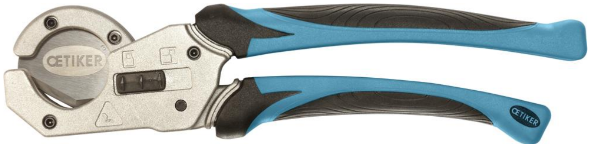
Pro Spec Hand Tube Cutter HTC 500 | 504 Item no. 14100504

Unique cutting cavity design provides straight cuts