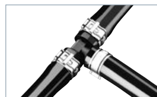
Use as a hose connector

Please contact the relevant manufacturer before using a product as a safety component.