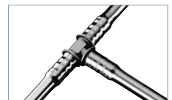
Use as a push-on connector