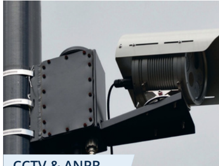
CCTV & ANPR

For added security, we also offer unique tamper-proof clamps which can only be tightened or released with a special screw bit.