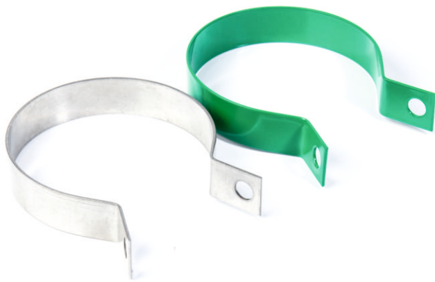
LLC - Long Legged Clamp in self colour and painted options