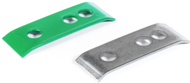
BUTPL - Butting Plate in self colour and painted options