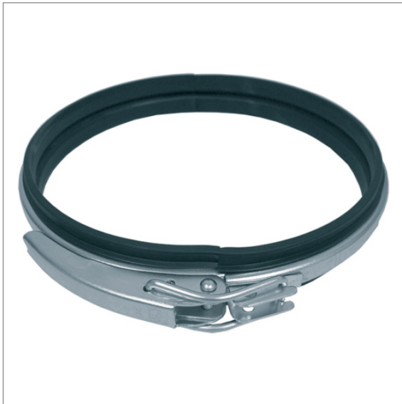
PRTE - Rapid pull ring EPDM

Rapid pull ring PRTE are electro galvanised and are used for quick and tight installation of duct systems. Equipped with a rubber gasket in EPDM which provides a tight connection and stability in the duct system, which ensures electrical conductivity through the unit. Standard temp. -30°C to + 80°C. With silicone seal for max 200°C - request quotation. Ø80 - Ø400 is equipped with a quick buckle/handle, the powerful steel spring provides a high quality opening/closing mechanism. Ø425 - Ø600 comes with bolt and nut.