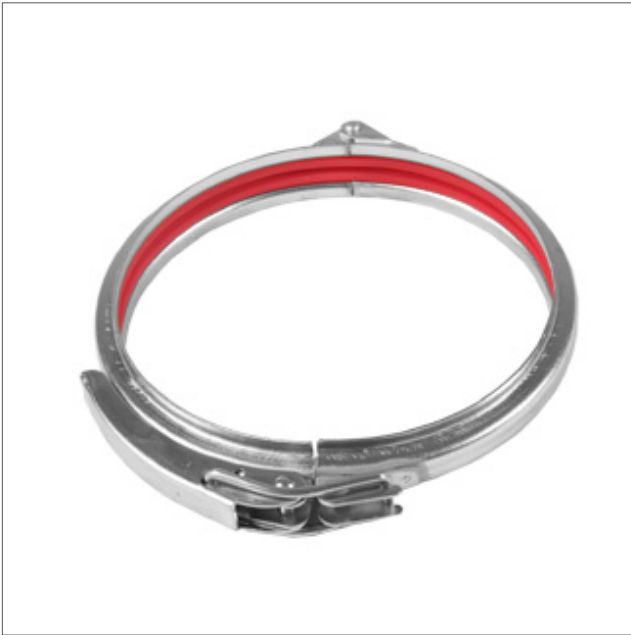
PRTE-1 - Rapid pull ring PVC

Rapid pull ring PRTE-1, electro galvanized with PVC sealing, for 1 mm duct system. Standard temperature is -30°C to +80°C. With silicone for max. +200°C - ask for a quote.