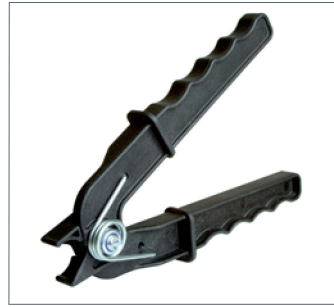
Manual Fitting Tool